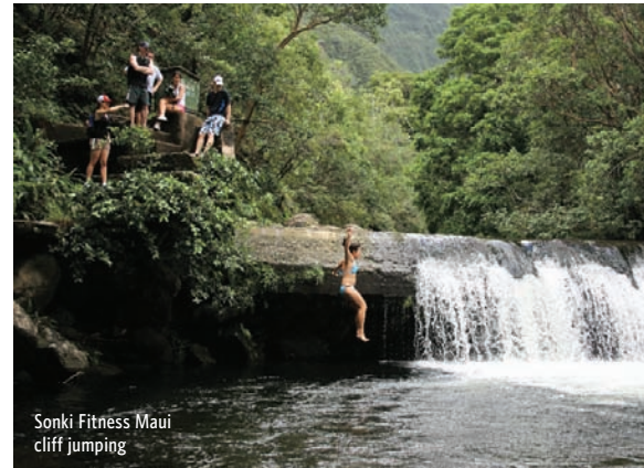
Sonki Fitness Maui cliff jumping

While sweating it out together, guests can expect to make new friends and form close bonds. Just how close is up to them. "We've had a few love connections during past trips that end up in marriages," Hong says.