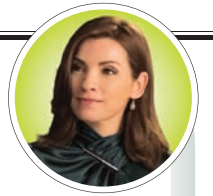
The Good Wife's Alicia Florrick (Julianna Margulies)