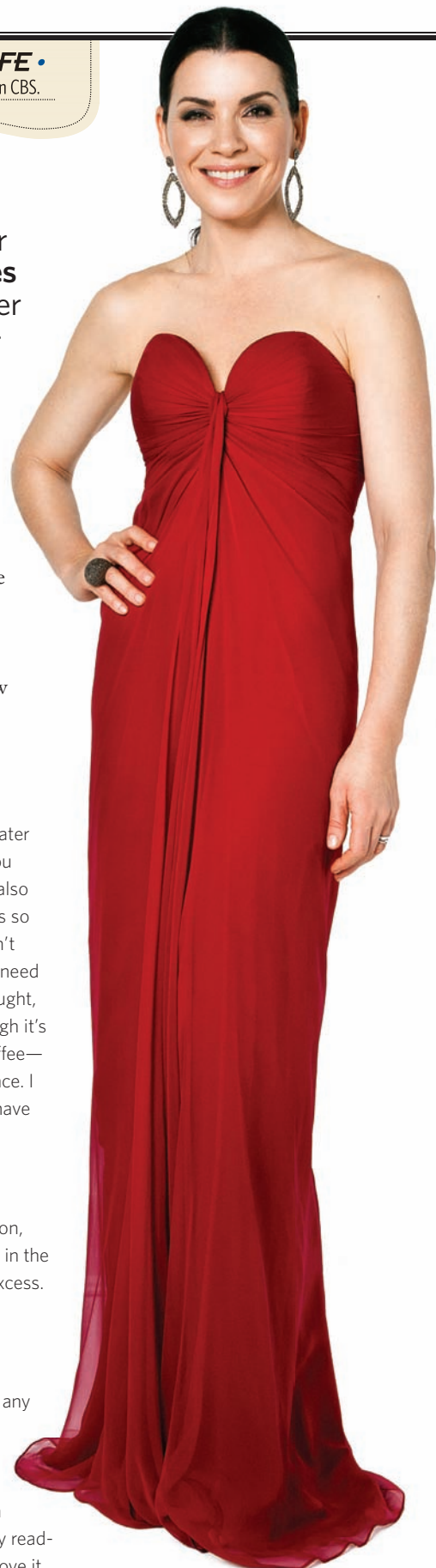
MARGULIES

The Good Wife star Julianna Margulies sips and noshes her way to red carpet-worthy skin